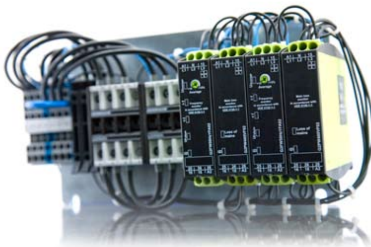
Prewired device combination with switching elements

At the site, the inverter side and mains side only need to be wired to the appropriate terminals. All three phases plus the neutral conductor should be connected on the mains side, even if only single-phase energy feedback is to be used. This is necessary because the system uses standards-compliant three-phase voltage monitoring to detect off-grid operation.